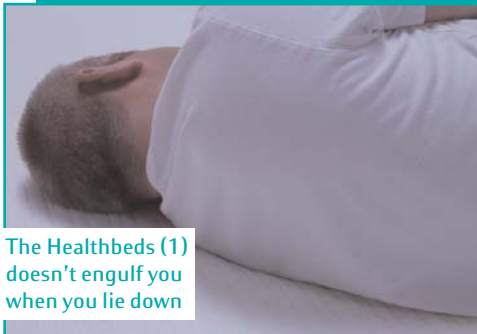
The Healthbeds (1) doesn't engulf you when you lie down

Drawing the covers up over a warm bed provides exactly the right warm, damp, dark environment for dust mites to breed.