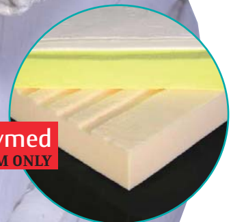
4 Kaymed FOAM ONLY